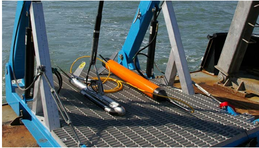
Image 1: SeaSpy Magnetometer and Klein 3000 Towfish Ready for deployment