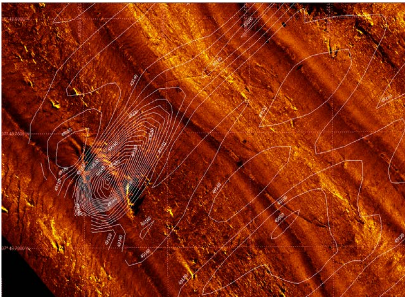
Image 3: SeaSpy Magnetometer Data processed in SonarWiz 5 into a contour map and draped onto the Side Scan Sonar Mosaic.